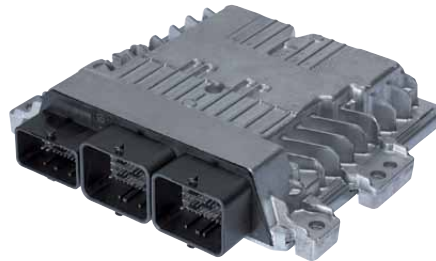
CMC 154-circuit header in compliant pin used for engine control unit