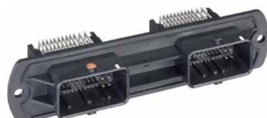
96-circuit series 36638