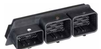
154-circuit series 34763