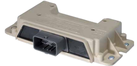
CMC 48-circuit header used for engine control unit

Standard CMC headers can be used as wire-to-board connections for powertrain and body-electronic applications.