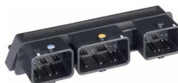
112-circuit series 64333