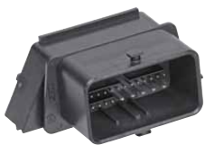
28-circuit series 47745