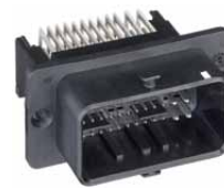
48-circuit series 36638