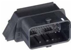
48-circuit series 500762