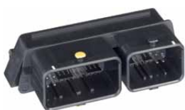
80-circuit series 502225