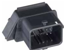
32-circuit series 64334