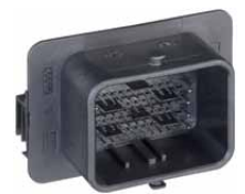
53-circuit series 98997